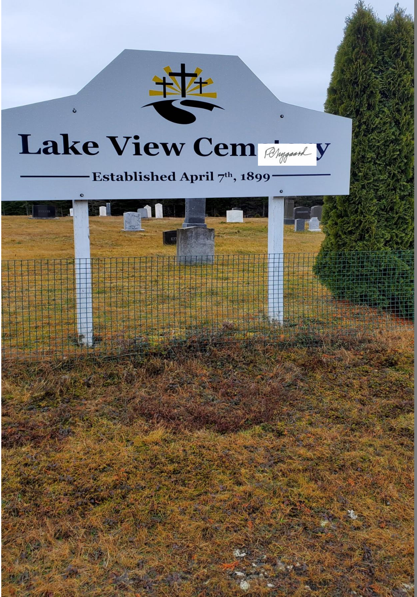
Gabarus Cemeteries Association